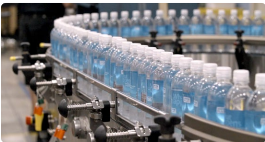
System Plast® Speedset™ brackets allow for faster and easier rail guide adjustments.